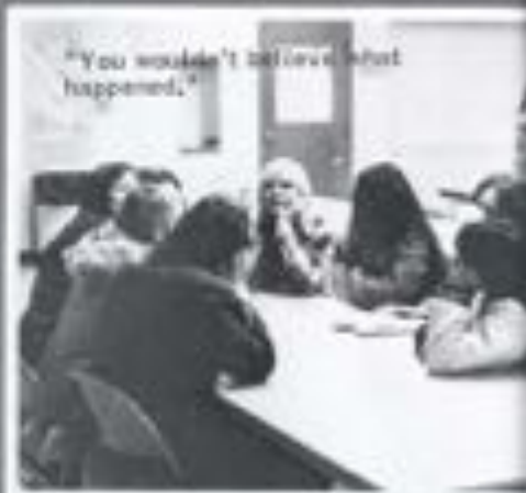
"You wouldn't believe what happened!"