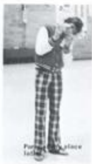
Perfect place for...