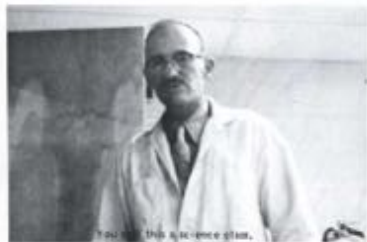
You see this science glass.