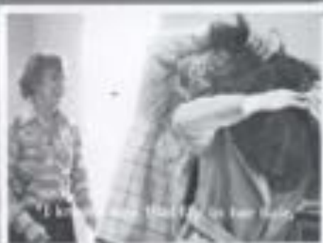
"I'll be in the way."