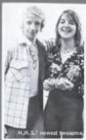
H.H.S.' newest broom-c...