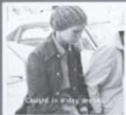
"Caught in Friday's drive."