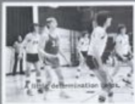
"A little determination goes."