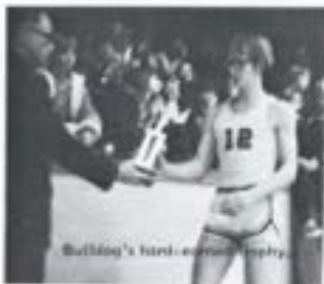
Bulldog's hard-earned trophy.