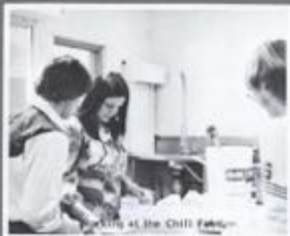
Working at the Chill Feed