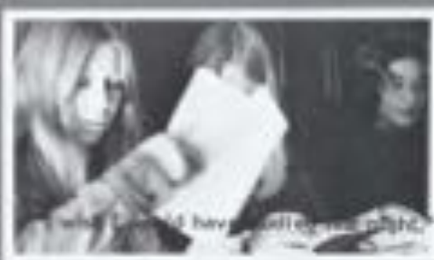
Who... will be...?"