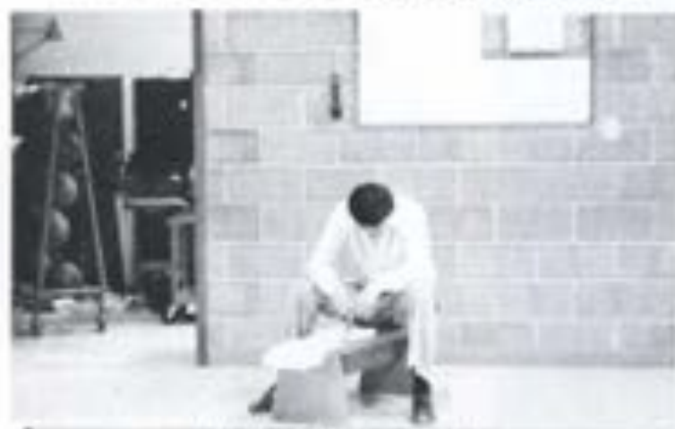
I don't believe these grades.