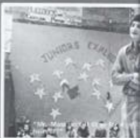
"My... More... of..."