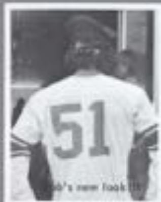
Bob's new look!