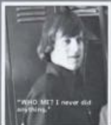
"WHO MET I never did anything."