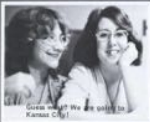
Guess what? We are going to Kansas City!