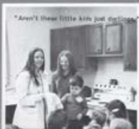
"Aren't these little kids just darling?"