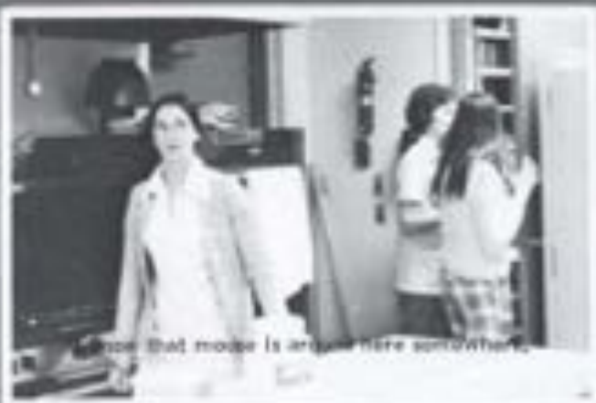
Hope that mode is again here somewhere.