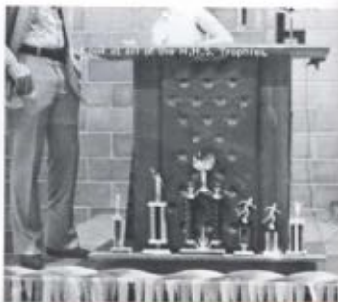
AWARDS PRESENTED TO STUDENTS