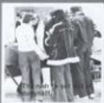
The path to...