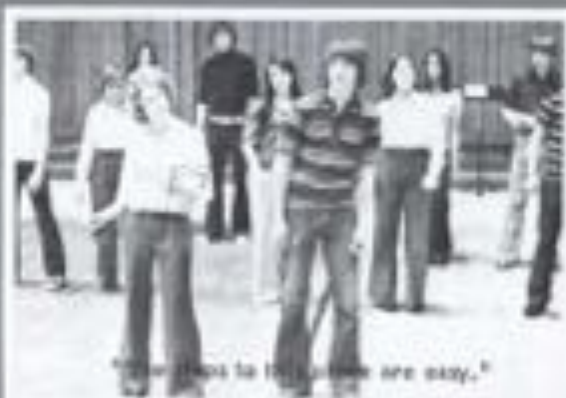
"How easy to find these are easy."