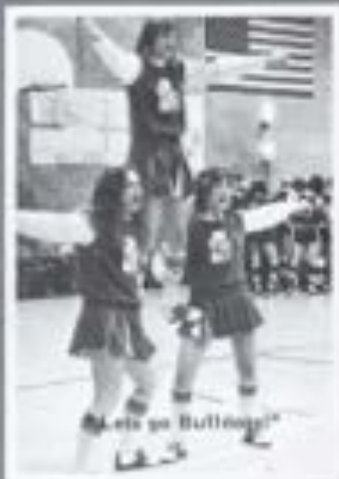
"Let's go Bulldogs!"