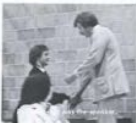
Miss [Name] presents an award.