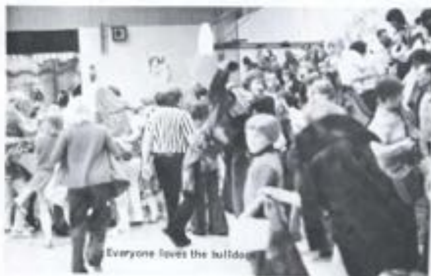
Everyone loves the bulldogs