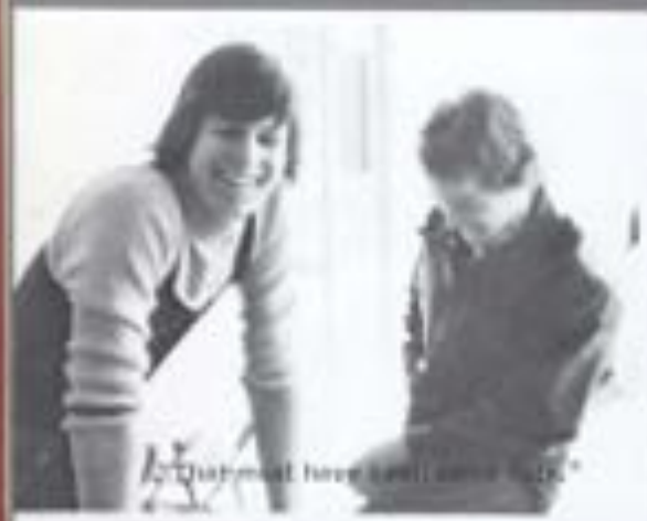
Our most here well come back!