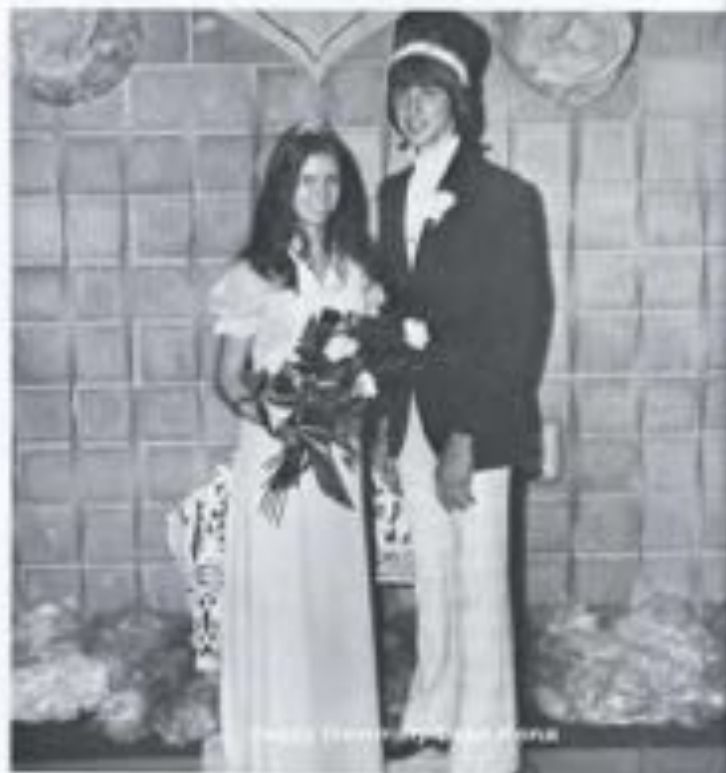
[unclear] [unclear] [unclear]