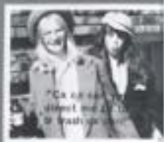
"Ca... about... wash...?"