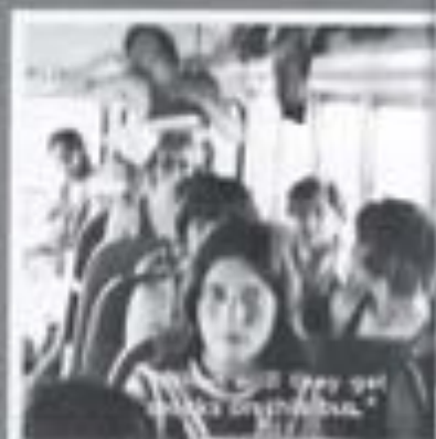
"Do you get...?"