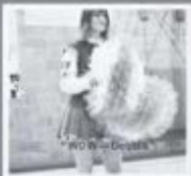
"WOW - Dudes!"