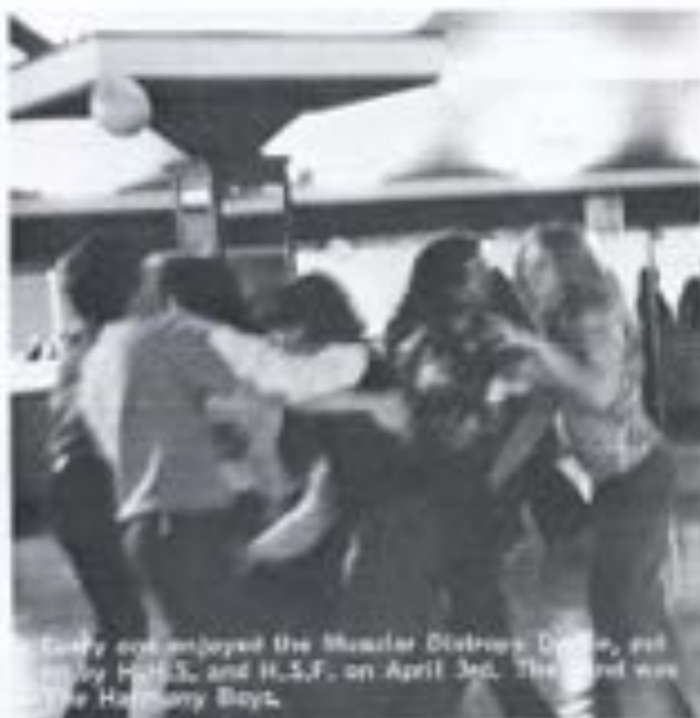
Everybody enjoyed the Musical Distropy Dinner, put on by H.S.S. and H.S.F. on April 3rd. The band was The Harmony Boys.