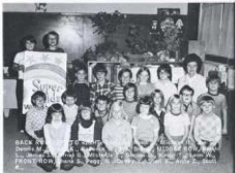
BACK ROW: [Names] MIDDLE ROW: [Names] FRONT ROW: [Names]