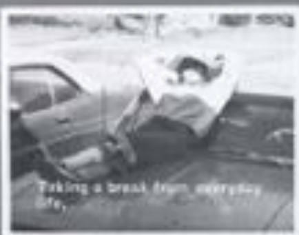
"Taking a break from everyday life."