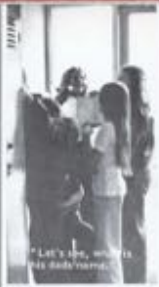
"Let's see, what is his dad's name?"