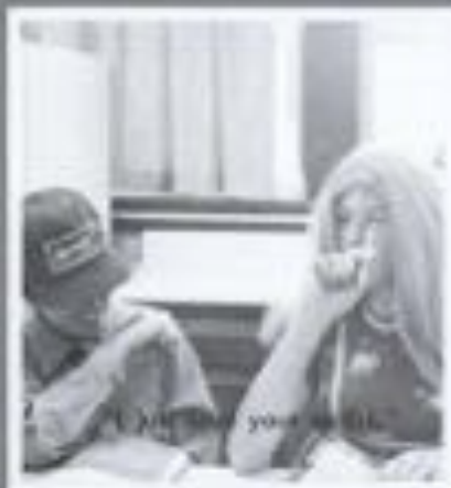
"Kill the your world."