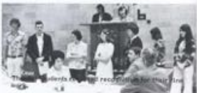
Students receive recognition for their lives